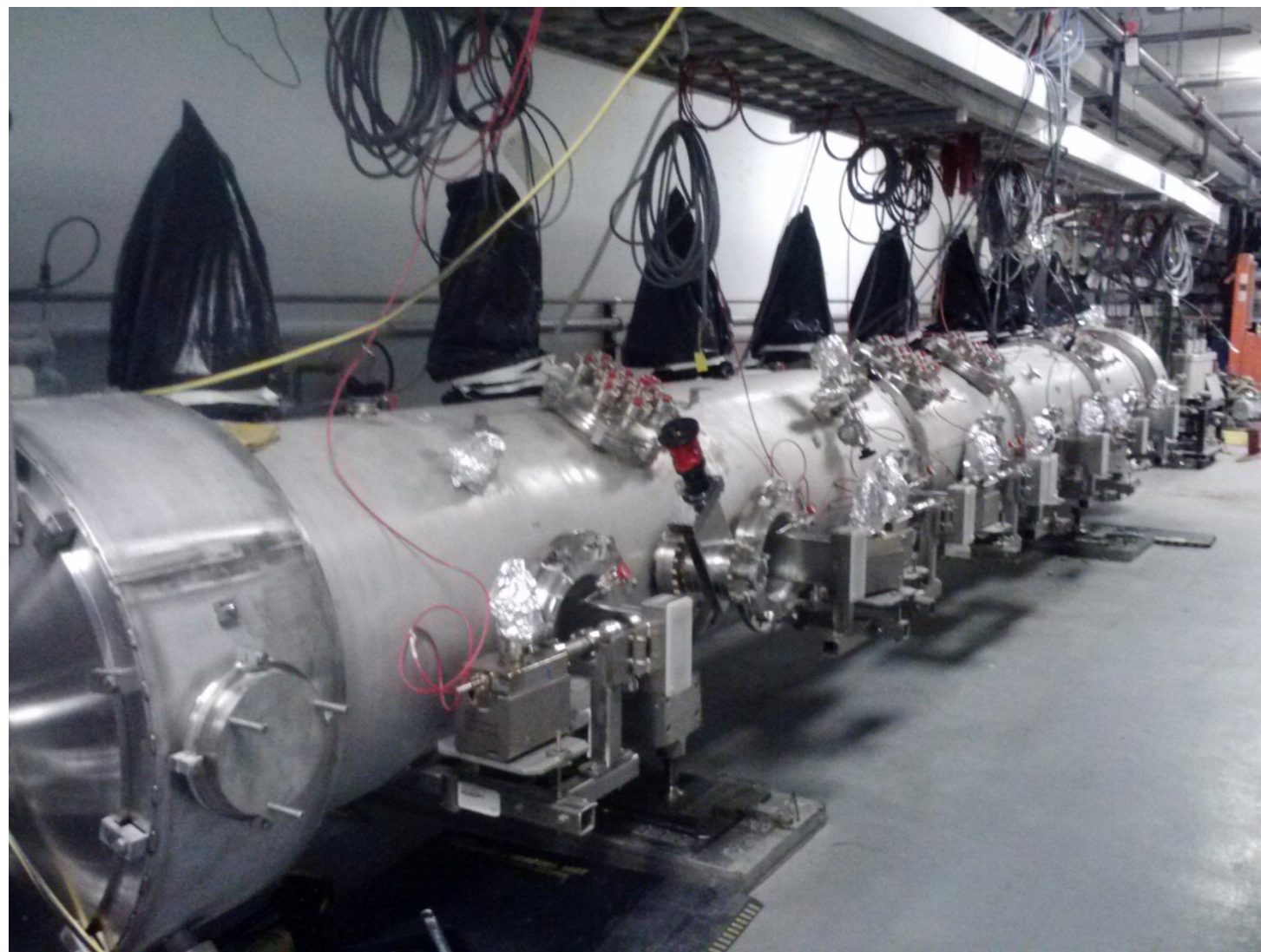
C-100 #8 SL26