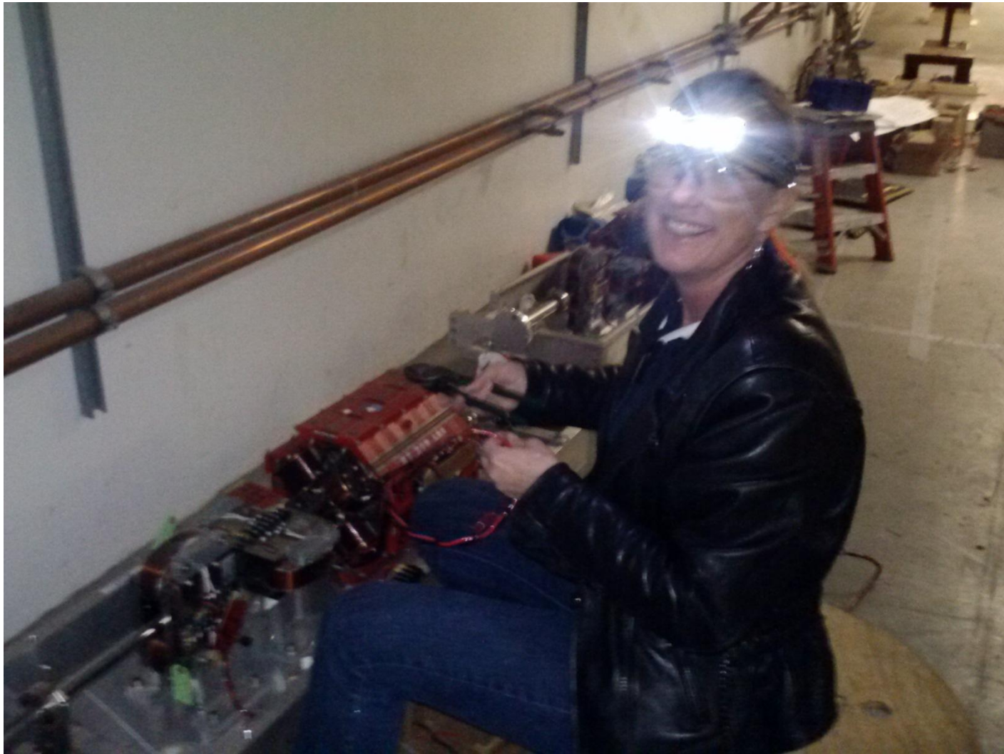
Girder Cable Terminations